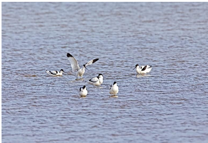
Avocet group